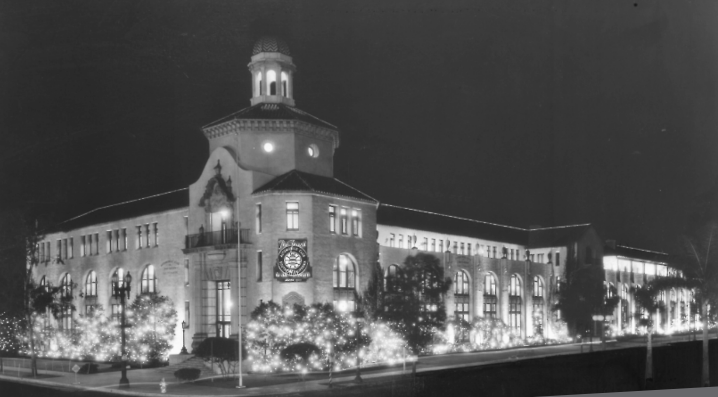
1935, corner of Adams Blvd and Figueroa St: The historic Los Angeles Headquarters in a nighttime photograph, shown decorated and lighted for Christmas.