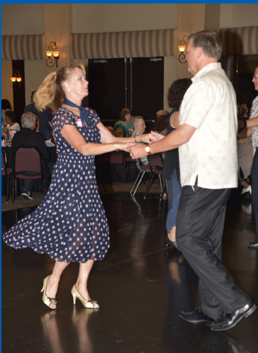
50s sock hop at The Grand! Turn the page for photos of the event